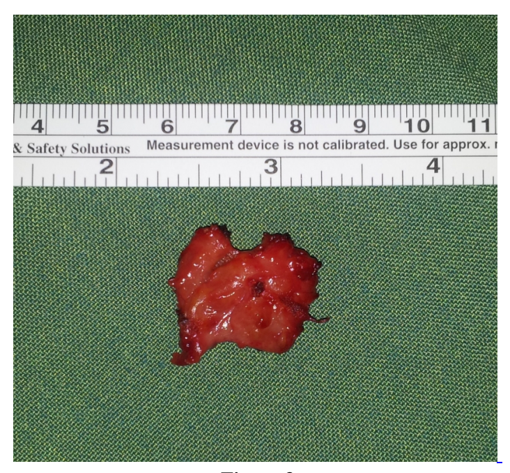
Figure 3 Excised reddish mass about 2 cm diameter

Pseudostratified ciliated columnar epithelium fitted multipl cystic spaces on histopathologic examination, pointed as bronchogenic cyst (Figure 4). Postoperative recovery was uneventful and no recurrence was observed at sixth month.