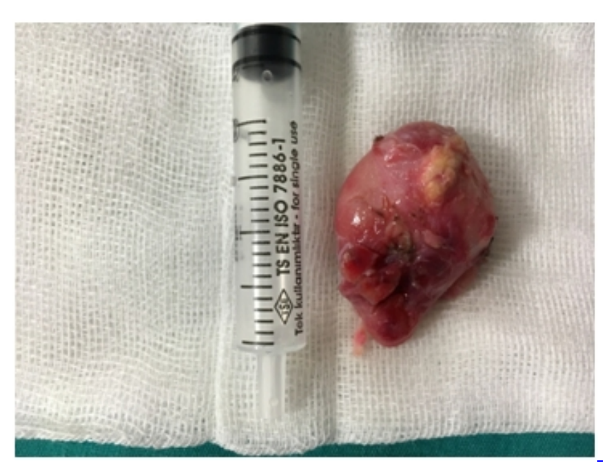
Figure 1 Lymph node obtained from the case

Pathologic analysis revealed cyst lined by stratified squamous epithelium with preserved granular layer with retention of keratinous debris suggestive of epidermoid cyst with an active inflammation (Figure 2). There were no histological findings of malignancy and no microbiological signs of atypical mycobacterium. There were no signs of recurrence during the 6-month follow-up period.