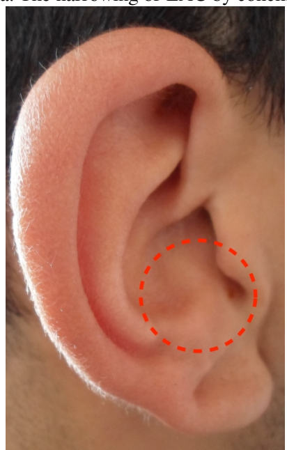
Figure 1B Preoperative view of right auricula. The narrowing of EAC by conchal cartilage is seen (dotted circle).

An optimum otoscopic examination could not be performed due to the blockage of the entrance of the EAC by this deformed cartilage. When the conchal cartilage was pushed posteriorly, we could hardly see the EAC with a 0 degree 2.7 mm pediatric endoscope. There was cerumen impaction in both EACs. Weber and Rinne tests were performed bilaterally. Weber test was normal, and Rinne test was negative in both ears.