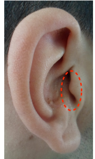
Figure 3B Postoperative view of right auricula, widening of EAC can be seen (dotted circle).

Figure 3A Postoperative view of left auricula, widening of EAC can be seen (dotted circle).