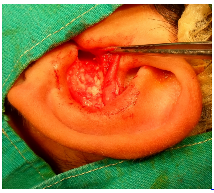
Figure 2 The elevation of conchal skin flap and the excision of the convexity of conchal cartilage.

The patient underwent conchoplasty using cartilage excision technique. Surgical correction was performed under local anesthesia (2% lidocaine with 1:200,000 Adrenaline). The desired amount of conchal cartilage to be exices was first marked out anteriorly on the concha. An anterior approach provided access to the conchal cartilage (Figure 2).