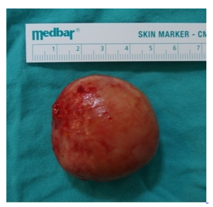
Figure 4 Postoperative pathology specimen.

Histopathological examination revealed that the mass was a mature cystic teratoma with hairy sebaceous material in the lumen (Figure 5). No complications developed in the postoperative period or the one-year follow-up period of the patient and no additional treatment was planned.