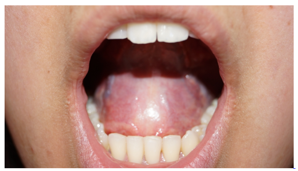
Figure 1 The preoperative appearance of the mass.

The 23-year-old female patient presented with a swelling under the tongue that had been present for nearly a year. The physical examination revealed a mass with an approximate size of 4x3 cm located in the sublingual area that was palpable in the submental area and displaced the tongue superiorly and a had regular surface (Figure 1).