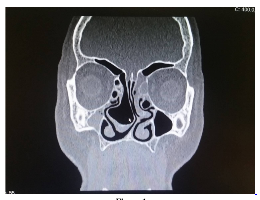
Figure 1 A coronal CT image, with extensive pneumatization (concha bullosa) of the right middle turbinate.

An 80-y-old female presented with an approximately 1-year history of nasal obstruction. The patient had no history of epistaxis or trauma. A rhinoscopic examination revealed right-sided hypertrophy of the middle turbinate, with left-sided septal deviation. The middle turbinate was covered with normal mucosa. Computed tomography (CT) (SOMOTOM; Siemens, Earangen, Germany) showed left septal deviation and extensive pneumatization (concha bullosa) of the right middle turbinate, with chronic inflammation of the maxillary (bilateral), ethmoid (left), and frontal (left) sinuses (Figure 1).