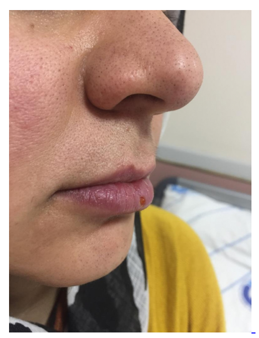
Figure 2 Image of decreased swelling on the 5th day of treatment