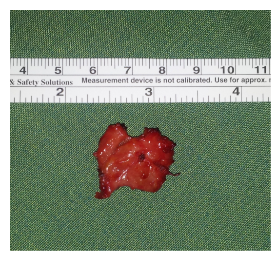
Figure 3 Excised reddish mass about 2 cm diameter

Pseudostratified ciliated columnar epithelium fitted multipl cystic spaces on histopathologic examination, pointed as bronchogenic cyst (Figure 4). Postoperative recovery was uneventful and no recurrence was observed at sixth month.