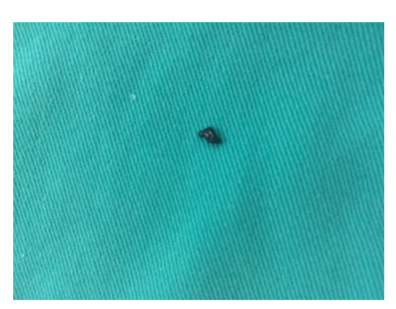
Figure 5 Extracted foreign body.

Intraoperative ultrasonography showed the mass with high acoustic shadow. After elevation of the superficial musculoaponeurotic system (SMAS), the foreign body was extracted (Figure 5).