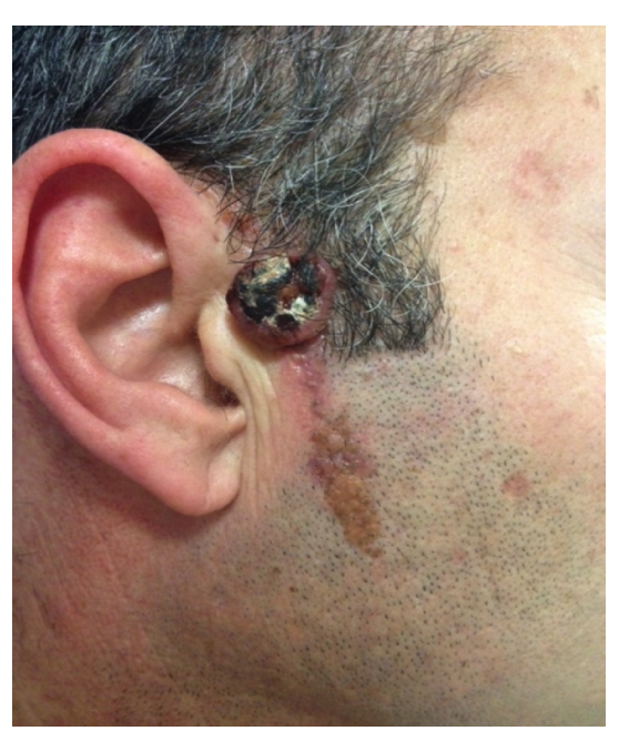
Figure 1 Nevus sebaseus, hyperpigmente mass on preauriculer region

He was diagnosed with BSC of the sebaceous nevus with these findings. The common blood count and biochemical laboratory tests were within normal ranges. There were no pathologic lymph nodes on the cervical ultrasonographic examination, and PETCT was normal. The chest x-ray radiographic examination was normal. After one year, there were no signs of recurrence in his follow-up.