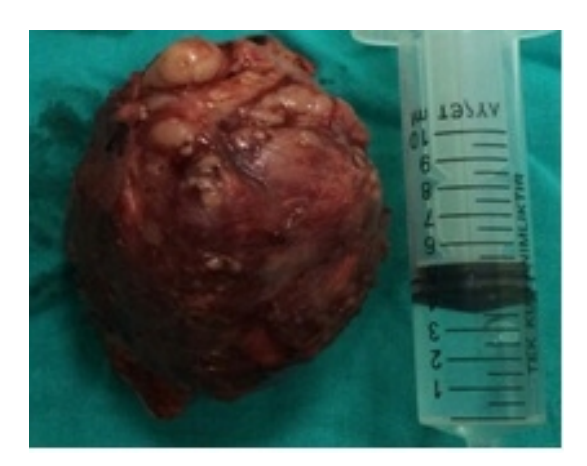
Figure 3 Total excision material

Surgical site was closed in accordance with the anatomic plan and a hemovac drain was placed. Post-operative first day 75 cubic centimeter (cc) hemorrhagic fluids were drained and 40 cc on the second day. As no fluid came from drain, the drain was removed on the third day. At the end of the first week, the suture was taken out and discharged as no problem was noted. The patients were followed up monthly for six months. After 12 months follow up, there is no clinically significant problem.