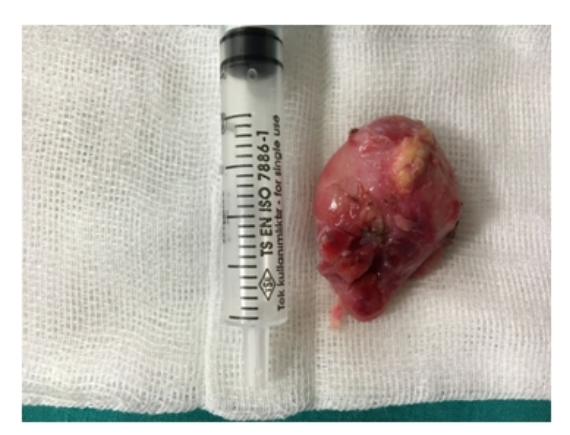
Figure 1 Lymph node obtained from the case

Pathologic analysis revealed cyst lined by stratified squamous epithelium with preserved granular layer with retention of keratinous debris suggestive of epidermoid cyst with an active inflammation (Figure 2). There were no histological findings of malignancy and no microbiological signs of atypical mycobacterium. There were no signs of recurrence during the 6-month follow-up period.