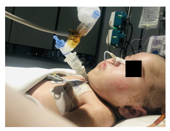
Figure 5 Image of the patient after tracheostomy.

The neck band was sutured to the skin from both sides and the operation was terminated after subcutaneous and skin closure on the sternum. No postoperative complications were observed. The patient is still being followed up as mechanically ventilated in the intensive care unit (Figure 5).