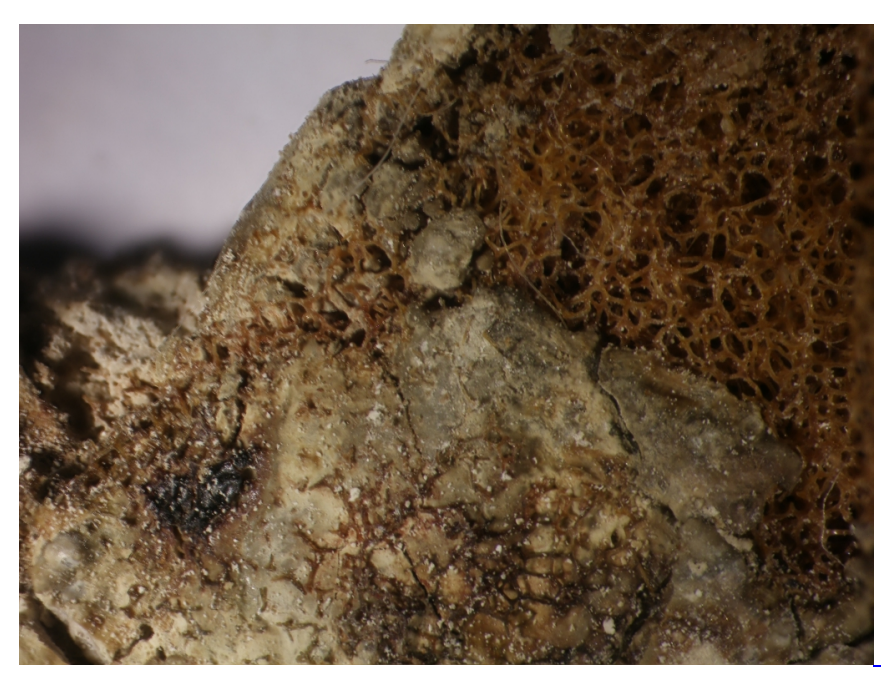
Figure 2 The rhinolith, the sponge seen inside (under 3D microscope)