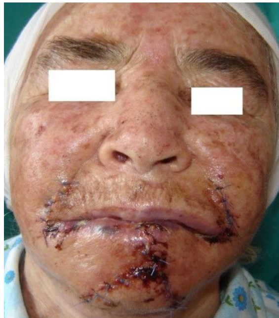
Figure 2 Postoperative 5th day, view of patient

Histopathology report of a previous incisional biopsy performed 15 days ago was reported as pleomorphic adenoma. There was no palpable lymph node on her neck examination. We performed complete removal of tumor from lower lip and repair of tissue defect using Bernard-Burow technique (Figure 2).