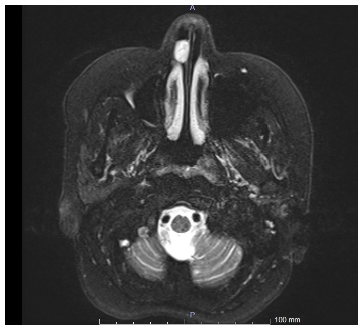
Figure 2 Solid mass adherent to nasal septum