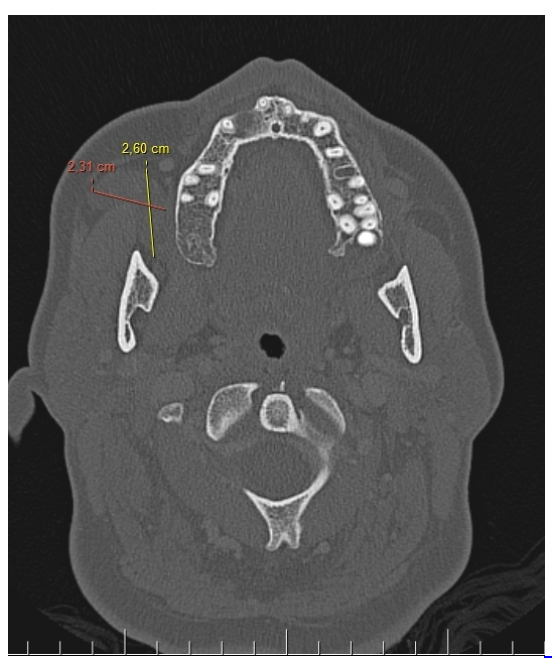
Figure 2 Preoperative MRI and CT

Imaging findings strongly indicated an adipose tissue, thus it was decided to remove. Therefore, no fine needle biopsy was performed. Lesion histopathologically defined as sclerosing, well differentiated adipose tissue in post surgical period. In addition, the positive CD34 and S-100 staining indicated well-differentiated liposarcoma. The tumor was completely removed and no additional adjuvant radiotherapy required post-operatively (Figure 3).