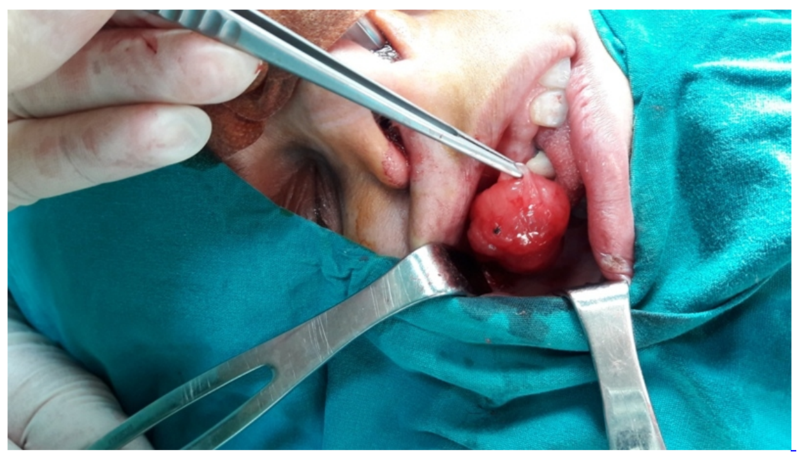
Figure 3 Peroperative Figure

Imaging findings strongly indicated an adipose tissue, thus it was decided to remove. Therefore, no fine needle biopsy was performed. Lesion histopathologically defined as sclerosing, well differentiated adipose tissue in post surgical period. In addition, the positive CD34 and S-100 staining indicated well-differentiated liposarcoma. The tumor was completely removed and no additional adjuvant radiotherapy required post-operatively (Figure 3).