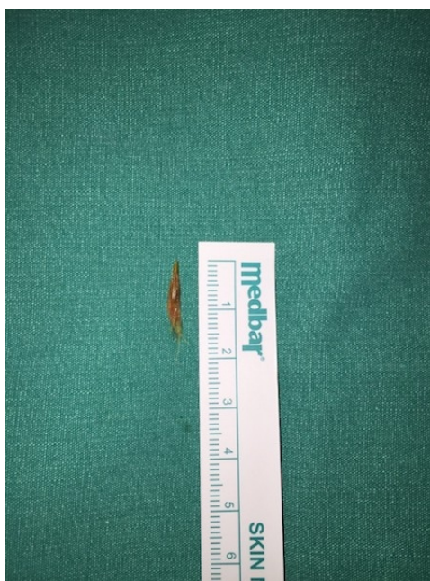
figure 4: The macroscopic view of the foreign body

We arrived to the conclusion that the foreign body reached extra laryngeal tissues by penetrating ventricle base. In the postoperative period, dramatic improvement was observed in the patient's clinic. Family who was questioned about foreign body aspiration previously is re-interviewed after surgery. They said that a few days before development of neck mass, they saw him trying to eat grass.