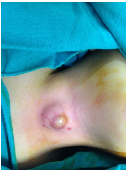
figure 2: Preoperative view of physical examination

During the surgery incision and drainage of the abscess was done. At the bottom of the drained abscess space there was a cystic lesion about 2x2 cm, also foreign body was seen laying from larynx through cyst base and extracted with the cyst (Figure 3).