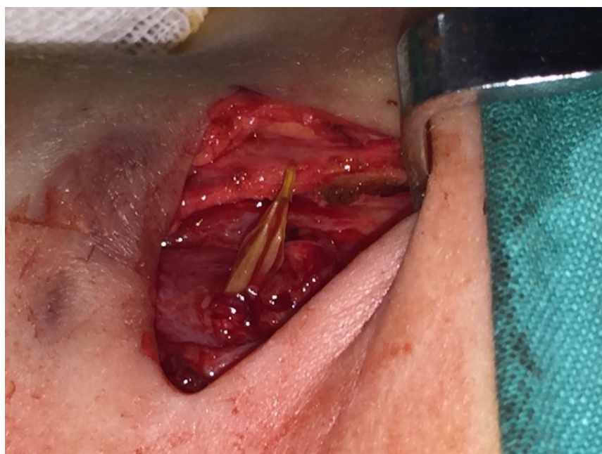
figure 3: The image of the foreign body dissected from the surrounding tissues Foreign body was a grass blade (Figure 4).

During the surgery incision and drainage of the abscess was done. At the bottom of the drained abscess space there was a cystic lesion about 2x2 cm, also foreign body was seen laying from larynx through cyst base and extracted with the cyst (Figure 3).