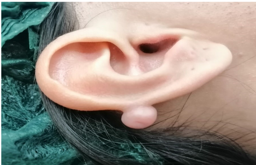
Figure 1 Pre-operative view of fibroepithelial polyp (FEP).