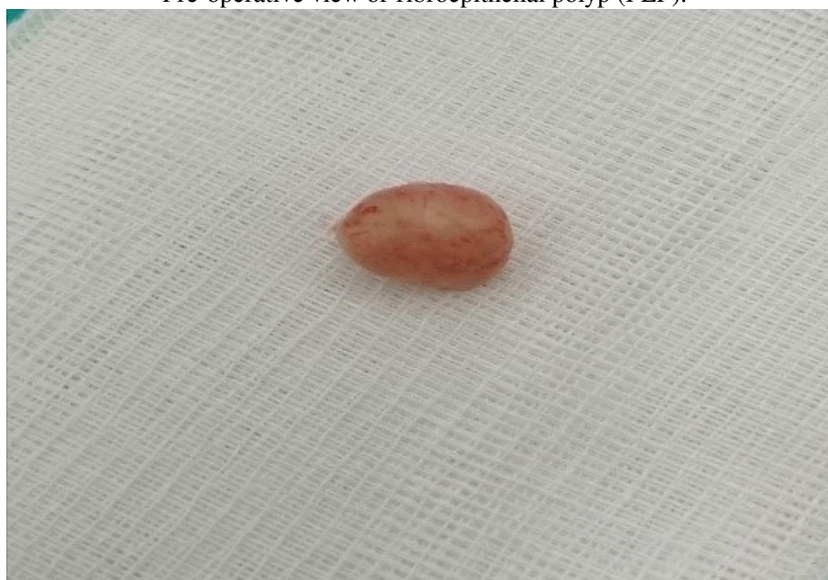
Figure 2 Macroscopic view of superior auricular helix FEP (0.7x0.5 cm) following intraoperative excision.