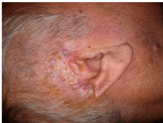
Figure 3 Postoperative appearance of the auricle

In the analysis of an intraoperative frozen section, a surgical margin was reported to be tumor-negative, and the tissue defect was closed using a split-thickness graft obtained from the thigh. Additional tissue specimens extracted during the reconstruction from the inferior and anterior surgical margins, were referred for pathological analysis. Tissues extracted for the reconstruction were reported to be tumor-positive, and the pathological results revealed a skip metastasis of the tumor that did not show deep invasion. The patient underwent a second surgery, and the surgical limits were enlarged. In the tissues extracted during the second intervention the tumor was indicated to be negative. Pathological investigation of the lesion revealed an acantholytic type squamous cell carcinoma on the grounds of otophyma. Postoperative radiotherapy was not administered due to the result of the oncology consultation. At postop Eighth month a recurrence was observed in the occipital region. After this, PETCT was applied to the patient. PETCT revealed a suspicious mass in the lung requiring biopsy. Patient didn't accept any surgical treatment and referred to oncology department.