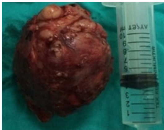
Figure 3 Total excision material

Surgical site was closed in accordance with the anatomic plan and a hemovac drain was placed. Post-operative first day 75 cubic centimeter (cc) hemorrhagic fluids were drained and 40 cc on the second day. As no fluid came from drain, the drain was removed on the third day. At the end of the first week, the suture was taken out and discharged as no problem was noted. The patients were followed up monthly for six months. After 12 months follow up, there is no clinically significant problem.