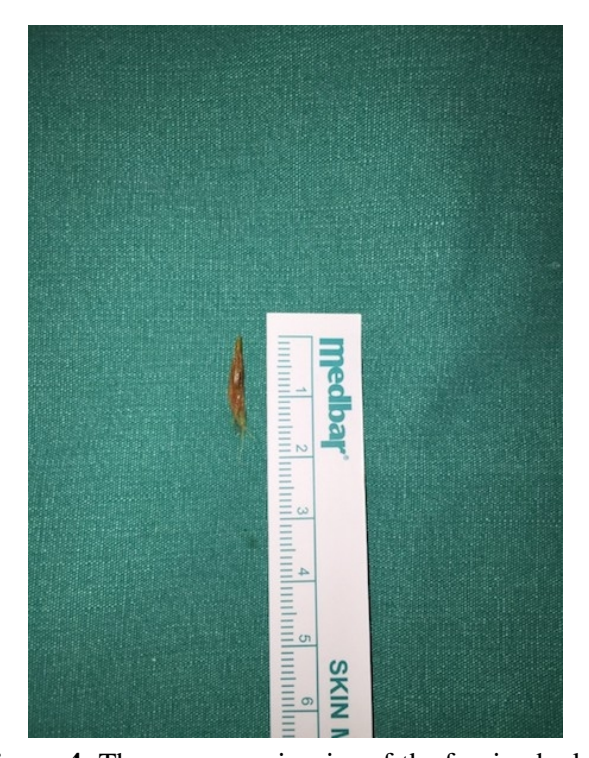
figure 4: The macroscopic wiev of the foreign body

We arrived to the conclusion that the foreign body reached extra laryngeal tissues by penetrating ventricule base. In the postoperative period, dramatic improvement was observed in the patient's clinic. Family who was questioned about foreign body aspiration previously is re-interviewed after surgery. They said that a few days before development of neck mass, they saw him trying to eat grass.