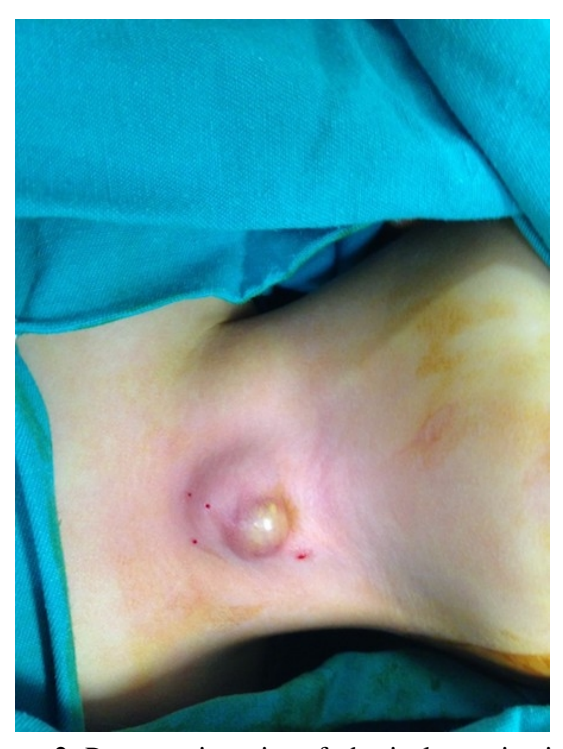
figure 2: Preoperative wiev of physical examination

As a result of absence of foreign body in CT scan continuation of medical treatment was offered. Abscess drainage performed at the outpatient clinic and patient was discharged after swellings regression. Because of development of swelling again within a few days, the patient presented to the ENT clinic and surgical intervention was planned (Figure 2).